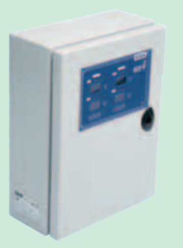
9020-4 LCD: Four channel IP65 wall mount with common alarm. Marine Directive @ MED 96/98/EC approved for all demanding applications. Please ask for specific leaflet 07-517.2.