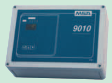
9010 LCD: Single channel IP 54 wall mount.

9010/9020 LCD: 19" rack with up to 10 modules [20 points-9020], or as a half rack with up to 5 modules [10 points-9020], or a quarter rack with up to 2 modules [4 points-9020].