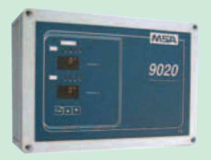
9020 LCD: Dual channel IP 54 wall mount. [ABS housing with up to five modules also available.]